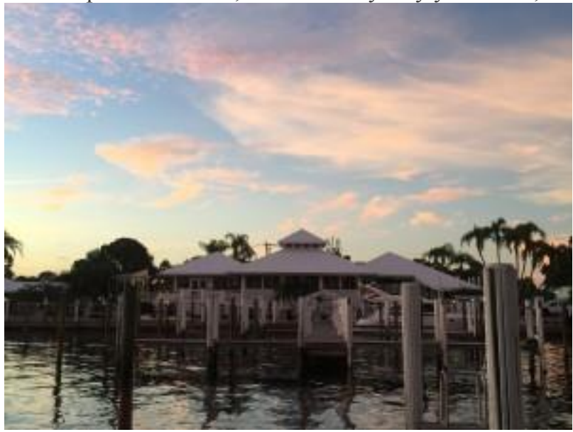
Leverock's At Pam Island Marina – Located right on the water, Leverock's offers fresh fish, oysters, broiled lobster tails, and so much more. A

Rum Bay on Palm Island – Offering an extensive menu Rum Bay is located on Palm Island and allows you to enjoy dinner out without leaving the island. Try a delicious grilled Mahi sandwich, Heart of the Oceans Salad with chilled lobster, a steamer pot of shellfish, fresh fish any way you like it, or even a homeade pizza.