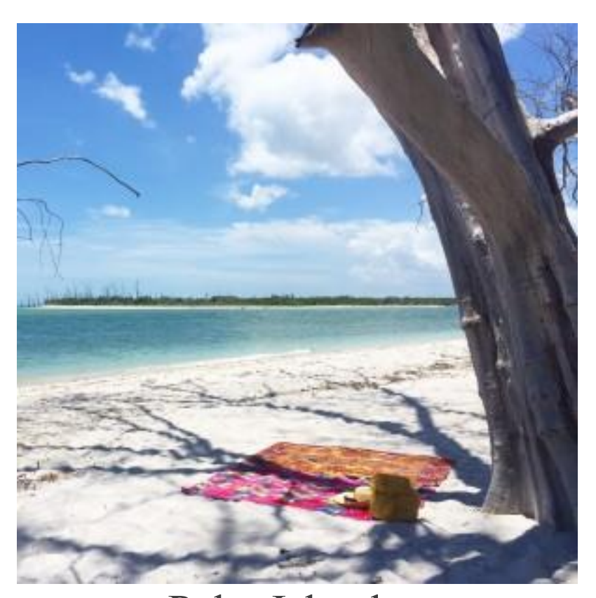
We discovered Palm\ Island haphazardly, we had planned to visit neighboring towns on the west side of the Florida coast but with a little more research became captivated with Palm Island, Boca Grande also known as the Charlotte Harbor area. These islands sounded like such beautiful places to explore