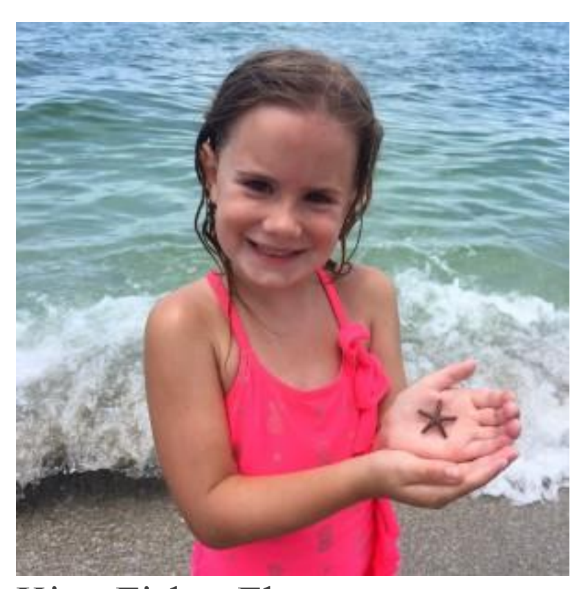
King Fisher Fleet – King Fisher Fleet in Punta Gorda offers sightseeing cruises to several barrier islands including Cayo Costa State Park. Begin your trip at 9:00 a.m. with a two hour narrated cruise and then you can enjoy 3 hours on this secluded island. Cayo Costa State Park lies on an eight mile long barrier island with a pristine, white-sand beach with many treasures to discover from sand dollars to starfish to sea urchins. A complimentary park service shuttle picks you and your beach gear up at the boat landing and deposits you on the beach. On the cruise you may have dolphins play and jump in the wake of the boat or pass a sea turtle swimming.