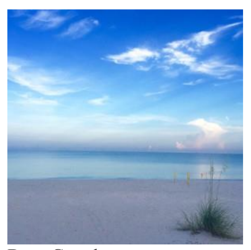
Boca Grande – A trip to Boca Grande is a must. The shell-lined beaches and glass-like water will entice your mind and soul. Both sunset and sunrise are something not to be missed in Boca Grande. One morning after discovering beautiful shell after beautiful shell, we put them in a pile. I noticed the pile began to