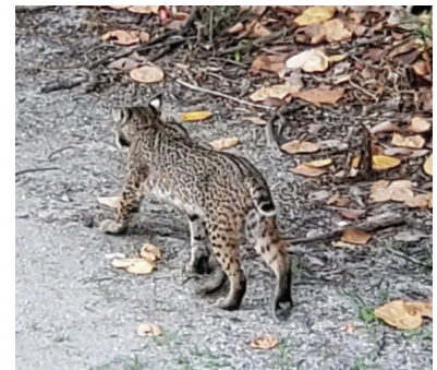
Early Morning Rounds