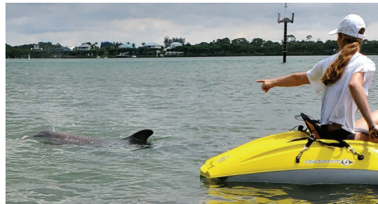
Checking the water temperature for the day