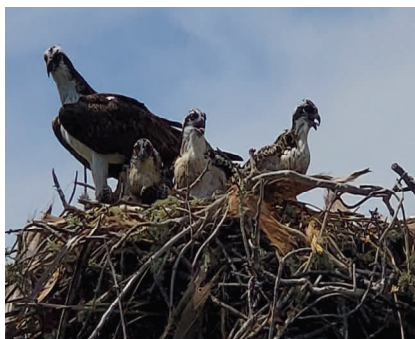
Our Barge Mascots, The Osprey Family

In addition, to her team member of the year accolades, she is now a guest services supervisor. So next time you hear her cheery voice greet you, say congratulations, once or twice!